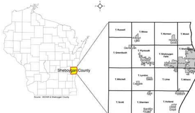
Sheboygan County, WI